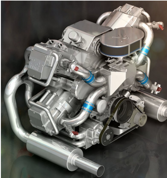
Figure 1 The engine is the heart of a car, as the kernel is the engine of a CAD system.

The same is true of the geometry kernel in a CAD system. The user creates the instruction to “Extend this flange” (pushes on the gas pedal) and expects a specific result. Using one kernel, “Extend this flange” may be executed through a specific set of geometry and display instructions (gasoline). In contrast, in another, it might use a completely different method for accomplishing the same thing (racing fuel). Both get the job done but in different ways. Just as you cannot quickly put a sports car engine into a minivan, it is challenging to change the geometry kernel that drives a CAD tool. Switching geometry kernels has a significant impact on the CAD software vendor and on customers whose designs are based on the legacy kernel.